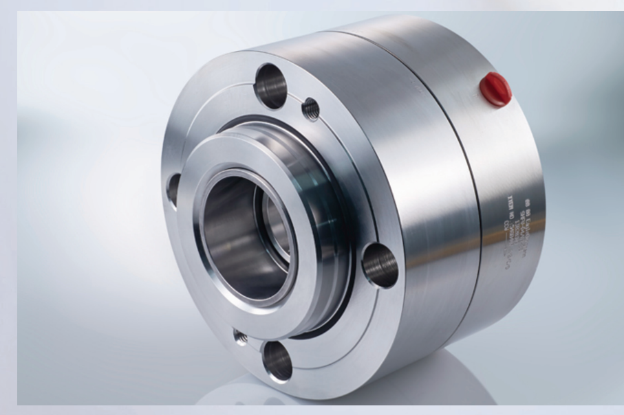
The SHVI single seal from EagleBurgmann is specifically designed for high pressures and speeds.

(MOL: Main Oil Line) of all types worldwide for many years. For the Canadian customer, EagleBurgmann developed the SHVI sealing variant with loosely inserted seal face specifically for the high-pressure range. The seal face